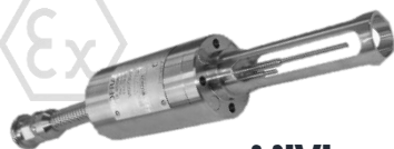
MIVI process viscometer