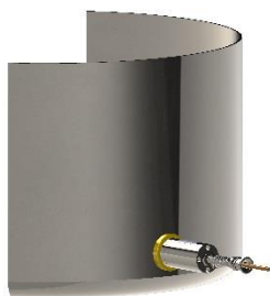
On reactor wall