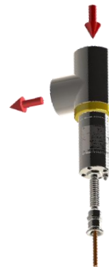
On a bypass loop

Any questions or specific needs regarding other viscosity solutions? Let us help you find the best match for your process by contacting us at: instruments@sofraser.com