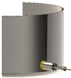
On reactor wall